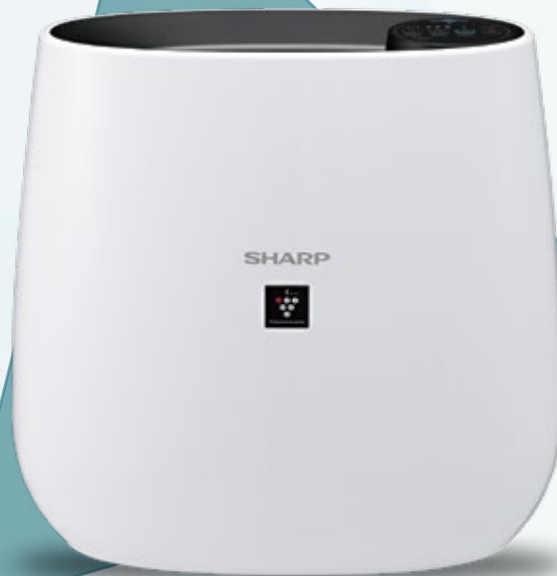
FP-JA30M / FP-J30M-B Air Purifier